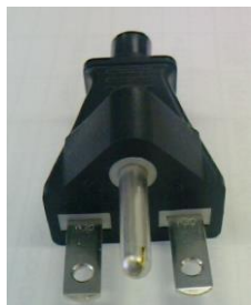
Figure 1 AC plug

For information on the power supply specifications of the EK90/SH, contact your local HAAKE distributor.